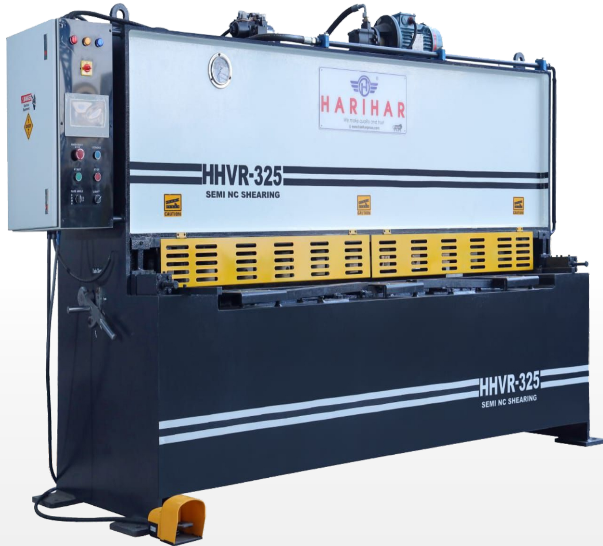
Variable Rake Angle Hydraulic Shearing Machine 1500 x 3mm to 8000 x 25mm